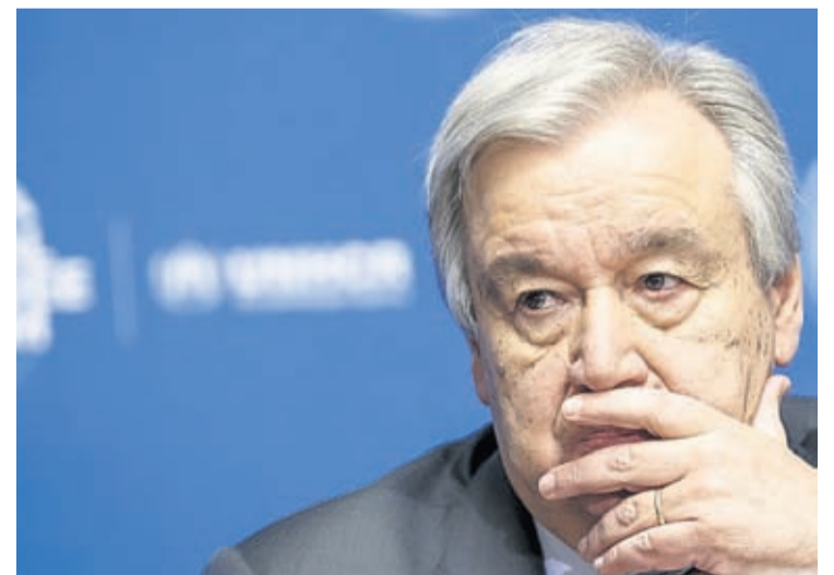
In this Dec. 17, 2019 file photo, U.N. Secretary-General Antonio Guterres attends the UNHCR - Global Refugee Forum at the European headquarters of the United Nations in Geneva, Switzerland.

ter of the coronavirus pandemic with over 190,000 cases and nearly 16,000 confirmed deaths. Guterres said in the letter, first reported by the Press Trust of India and obtained Tuesday by The Associated Press, that although September is some months away "the medical community anticipates that the pandemic will continue to cycle with varying degrees of severity, depending on the ability of the affected nation to implement aggressive identification, testing, tracing and containment measures." While the General Assembly could consider postponing the high-level meeting to a date in 2021,